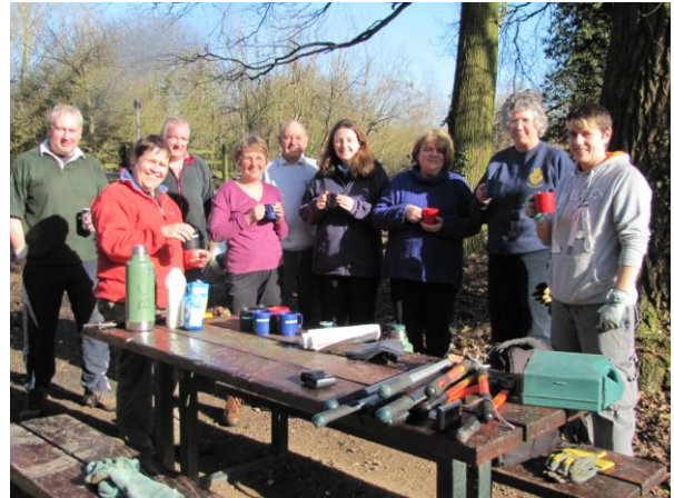
Taking a break on the Community Orchard project

The time has come to look forward rather than back. The winter has been severe, particularly December with record snow falls, but we are already looking forward to spring. The Community Orchard project is taking shape on the Weir Field in the corner between the River Arrow and the old Railway Line. 50 fruit trees will be surrounded by hedging, whilst an untidy area by the picnic benches has been cleared and the snowdrops and daffodils currently there will be supported by further planting of wild flowers to make the area more interesting and pleasant for the community to enjoy.