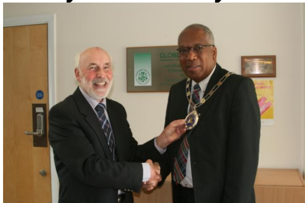
Outgoing Mayor Chris Gough and new Mayor Lennox Cumberbatch

The local elections seem a long time ago now but I am especially pleased that the Town Council has its full quota of 16 councillors, of which six of the new team are women, an increase of 100% from the pre election group of councillors.