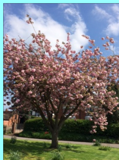
Oversley's cherry tree in bloom

Also, the OGRA committee are working hard to persuade Warwickshire County Council to repair and reopen the closed footpath in the village which has frustrated many dog owners who used this path on a regular basis and has inconvenienced the many walkers that pass through Oversley Green.