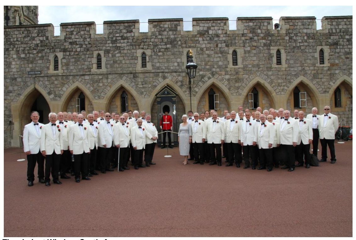
The choir at Windsor Castle four years ago

Following a highly successful and sell out concert at Worcester Cathedral at the beginning of May, the popular and in demand Alcester Male Voice Choir are all set to make a return visit to another prestigious venue, St George's Chapel, Windsor Castle in July. The choir last appeared there some four years ago and delighted an international audience with a lunch time recital.