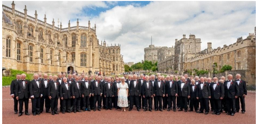
Windsor Castle 2019