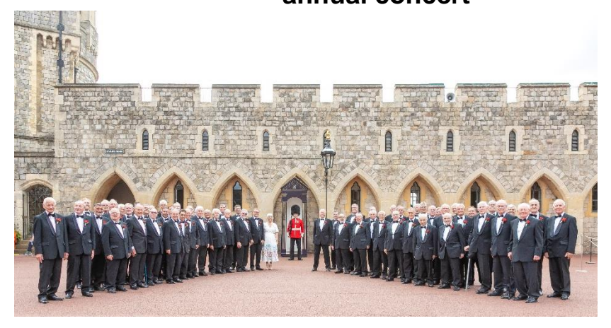
The Alcester Male Voice Choir pictured at Windsor Castle last summer following a recital in St Georges Chapel

Tickets are now available for the Alcester Male Voice Choir's 46th annual concert which will be held in May. The concert has over the last few years been held at various prestigious venues and this year is no exception as the Royal Birmingham Conservatoire, which is a world class institution, has been chosen to stage this popular event.