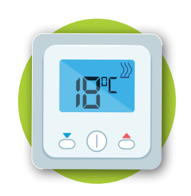
Heat rooms you spend most time in to 18°c