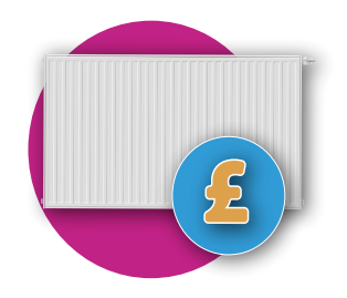
Use energy saving tips to save money on heating