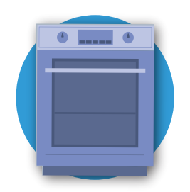
Make sure appliances are safe and working well