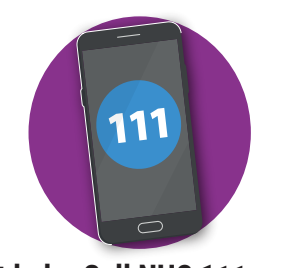
Get help. Call NHS 111 and 999 for emergencies