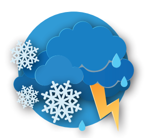
Download the Met Office app and check the forecast and the news

A guide to help you stay safe and well this winter 2023/24